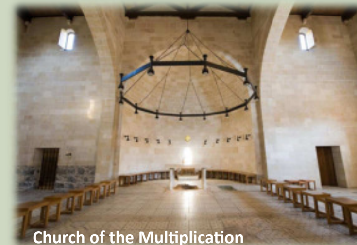
Church of the Multiplication