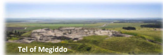
Tel of Megiddo

Start the day with a visit to Bethsaida (hometown of Peter, Andrew, Philip and the third most mentioned city in the New Testament), Kursi (where the demon-possessed man was healed), and an eastern site of the Feeding of the 5,000. Proceed to the mystical city of Safed , said to be founded by one of Noah's sons after the Flood, high up overlooking the Sea of Galilee. Walk the quaint cobblestone streets and visit the famous artists' quarter. Continue through the rolling hills of Galilee to Nazareth (Church of the Annunciation) , and to the site of Mary's Well , and then to Cana , site of His first miracle. Also visit the Nazareth Village , an accurate, full-scale recreation of first-century Nazareth, including homes, storage caves and a synagogue, set on the last remaining field that was farmed by Nazareth villagers at the time of Jesus. Restoration of the farm site and construction of the village were done with first-century building techniques. Return to our hotel in Tiberias for dinner and overnight.