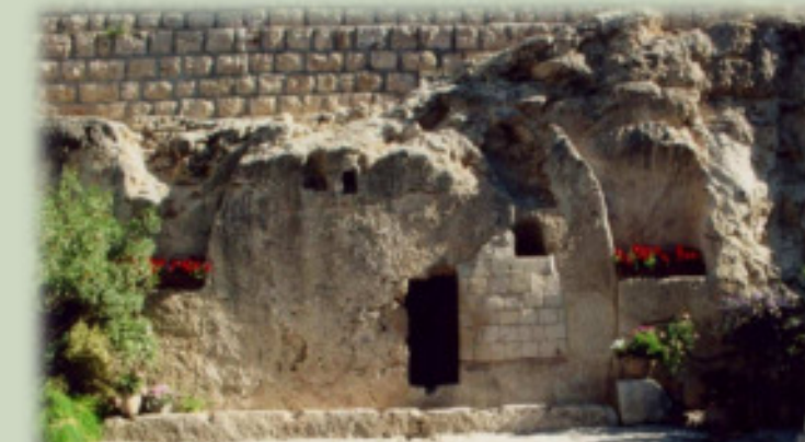
The Garden Tomb