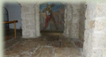
Pilate's Judgement Hall