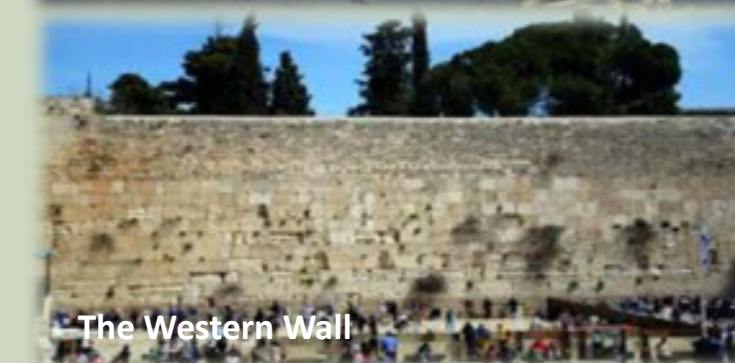
The Western Wall