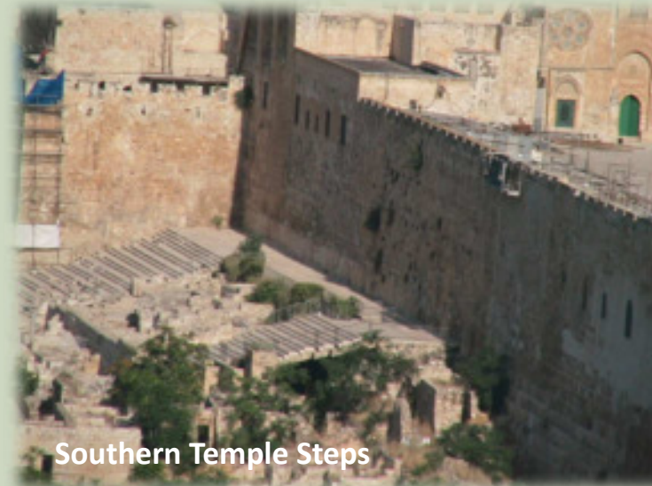
Southern Temple Steps